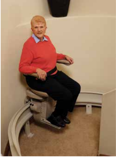
Custom crafted for a precision fit around curves.